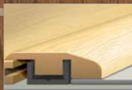
Multi-Purpose Reducer | SVMPR Shown with vinyl