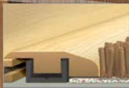
Multi-Purpose Reducer | SVMPR Shown with carpet