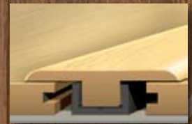
T-Molding | SVTMD