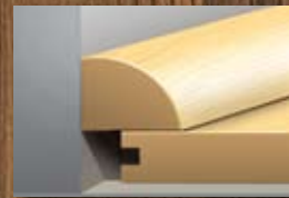
Quarter Round | SVQTR