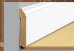
Wallbase | SYWLB Color 100 White