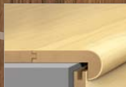
Flush Stairnose 7mm | SVFS7 Flush Stairnose 8mm | SVFST