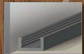
Molding Track | SVTRK