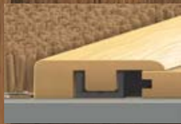
Carpet Reducer/End Molding SVEND

All moldings are available in 7' 10" lengths.