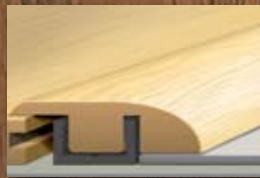
Reducer Strip | SVRED